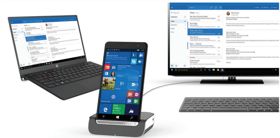
All peripherals sold separately, shown from left to right: HP Mobile Extender, HP Desk Dock, and HP Display. Apps sold separately, availability may vary.

Join the new mobile revolution. The HP Elite x3 combines PC power and productivity, tablet portability, and smartphone connectivity in a single, astoundingly sleek, enterprise-secure, and tested-tough device that can dock 2 with your screens and keyboards when you need to work big.